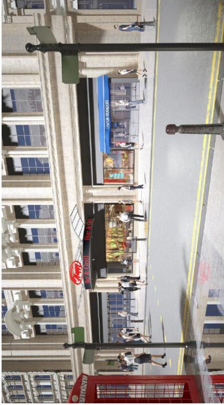
Figure 23: Unit 4 Rowlocks, Proposed Revitalization (viewing from Coventry Street)