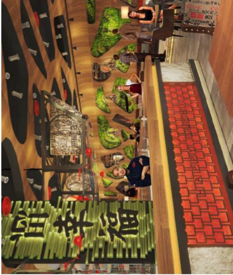
An example interior