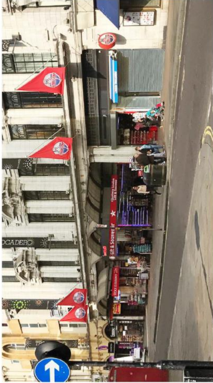
Figure 2.2 - View of Piccadilly, London, showing existing streetscape from University Street